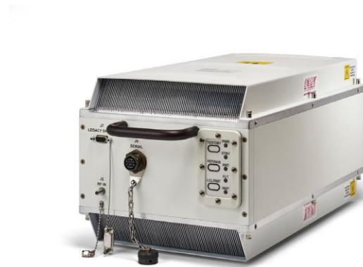
CPI GaNLink 160 W Ka-band GaN SSPA/BUC, Model B5KO

Backed by over 40 years of satellite communications experience, and CPI's worldwide 24-hour customer support network that includes more than 20 regional factory service centers.